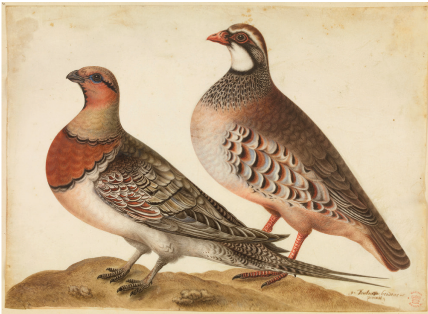
Fig. 3. A pintail sandgrouse Pterocles alchata (left) and a red-legged partridge Alectoris rufa (right), watercolour, with body colour, on vellum, 272 x 378 mm, signed: G. Toulouze Brodeur/pinxit. This is the 'picture of the Jangle and Patridg' Courten bought of 'Mr Toloze' and sent back from Montpellier in 1681. Of the drawings he bought from Toulouze, this was the most expensive, estimated at £99 by Courten (£88 for the picture and £11 for the glass pane). © The Trustees of the British Museum, SL.5279.5.

expenditure on seventeen framed pictures of naturalia seems rather extravagant, and we should probably see this as a replacement value – what it meant for Courten to re-acquire these pictures. We do not know what the valuation of the total consignment was, but the estimated price of Toulouze's seventeen pictures certainly is a measure of Courten's esteem for pictorial works. 78